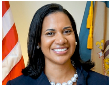
Delaware Department of Health and Social Services (DHSS) Secretary