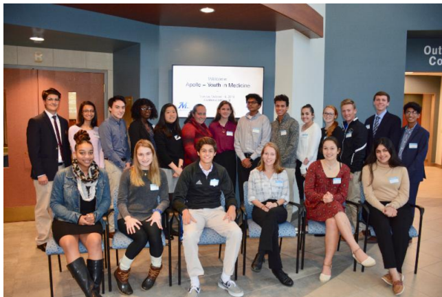
Apollo - Youth in